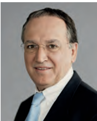
Benoît Battistelli President European Patent Office

We all have a responsibility to secure a better future for ourselves and coming generations. Make a difference and submit your preferred nomination today.