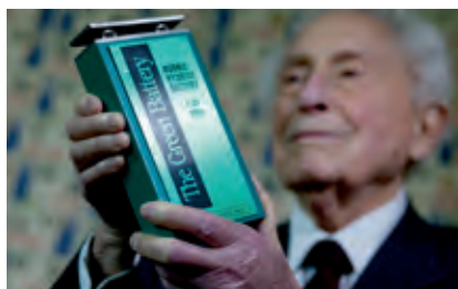
Stanford Ovshinsky, Non-European Countries